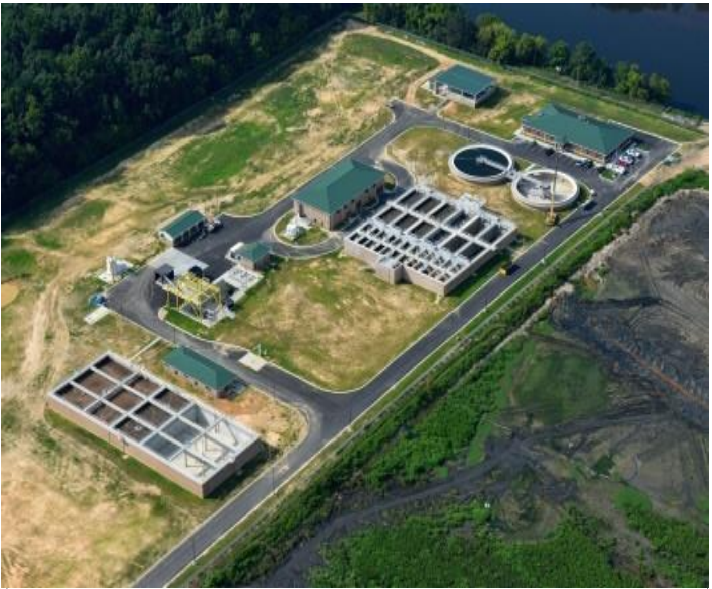
Figure 1. City of Camden Waste Water Plant

The Camden Tennessee waste treatment plant started a project to eliminate chlorine gas for disinfection. Throughout the United States wastewater network, this trend has been taking place for many years due to the potential hazard of release of chlorine gas in populated areas. The natural replacement is sodium hypochlorite. Sodium hypochlorite and its derivatives can be used as a powerful disinfectant that eliminates residual pathogens from water in the final stage of the water purification process. Metallic salts such as ferric sulphate and alum can be added to bind impurities and reduce harmful and malodorous substances. Sodium hypochlorite is used in numerous industries for water treatment and disinfection of water. Other typical uses are in cooling towers in power plants to thwart algae growth, steel mill water treatment and food and beverage for cleaning and disinfection to name a few.