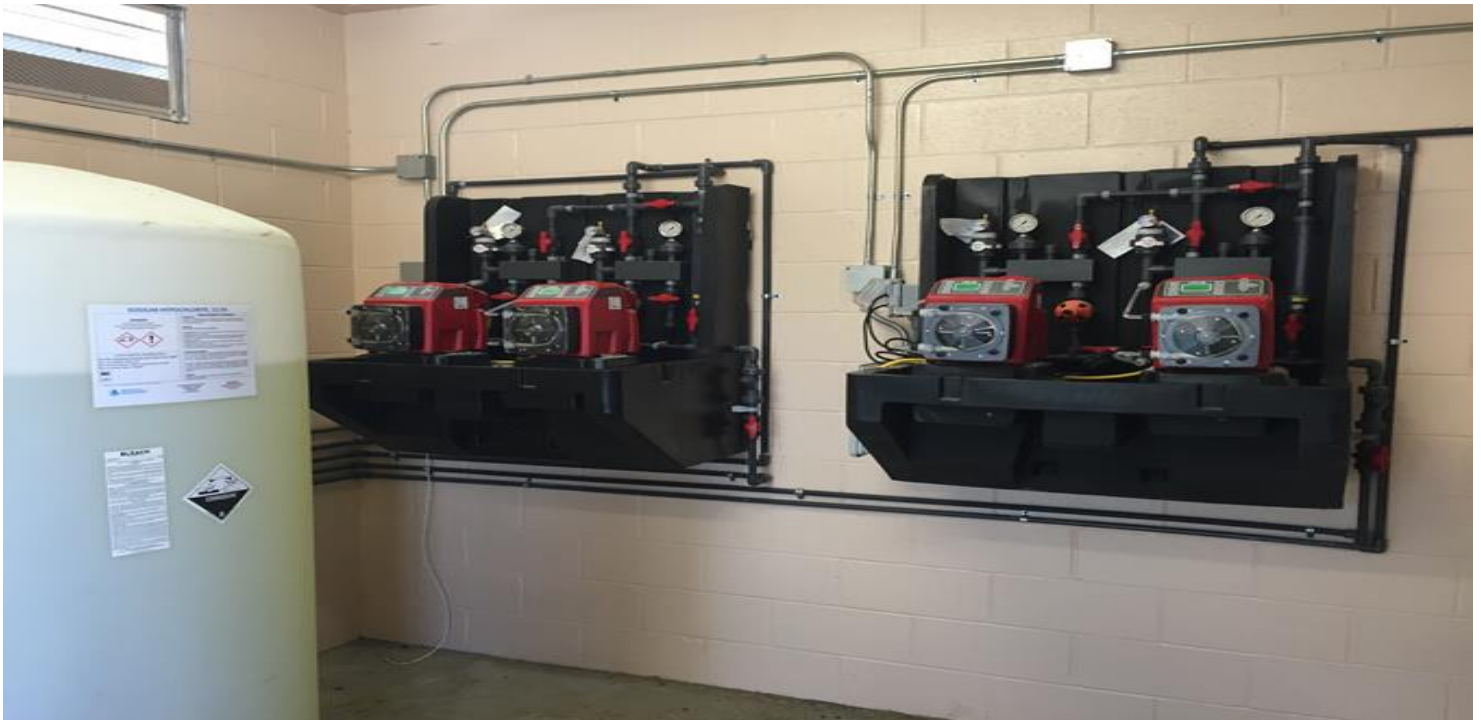
Fig. 2: Flowrox Packaged Pump Systems installed at Camden, TN waste water facility

Another desirable feature of the Flowrox Packaged Pumping Systems was that the city had limited space for installation. For this reason the city requested systems that would be wall mounted. Flowrox Packaged Pumping Systems can be either floor mounted or wall mounted. The bases of the units are rotationally molded solid components. So there are no weld seams and entire unit has excellent corrosion resistance. The units supplied were duplex units, meaning two pumps per base, and were 36-inch width. They were then mounted to the wall with stainless steel mounting provided with the units.