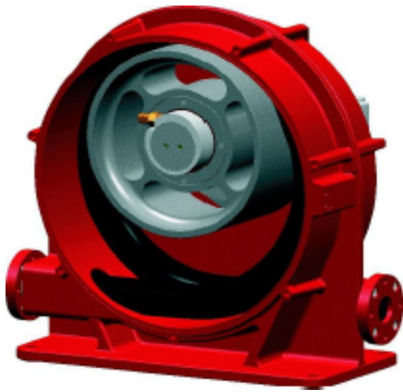
Fig. 5: Flowrox rolling design peristaltic pumps with patented hose compression system and hose connection system

Flowrox launched its first smart pumps and valves in September 2015 at Minexpo show in Las Vegas. These valves and pumps are industrial internet of things (IIoT) ready and are capable of performing advanced diagnostics on pump and valve performance.