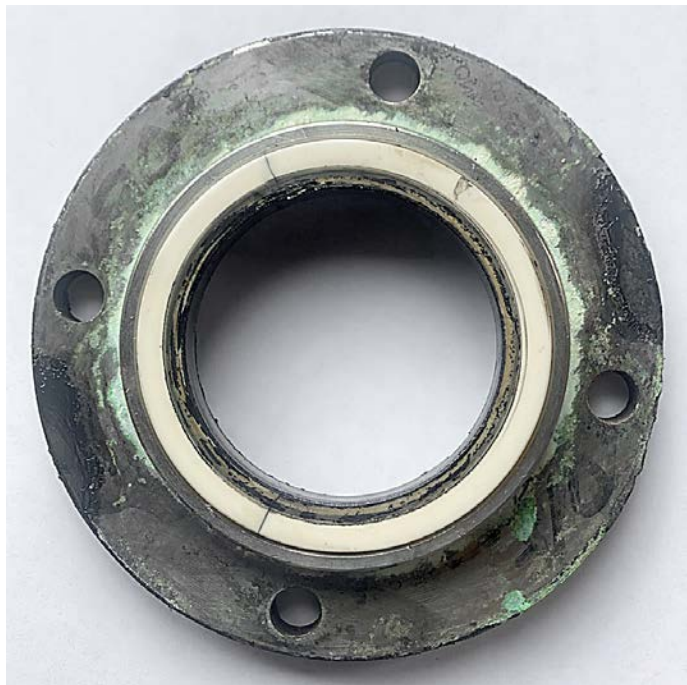
Figure 1 Failed mechanical seal exhibiting cracked seal faces and paint buildup

Viscous fluids such as paint can cause build up along the faces and edges of the seal. Over time, this can cause failure. See Figure 1 for an example of a seal that failed due to paint buildup.